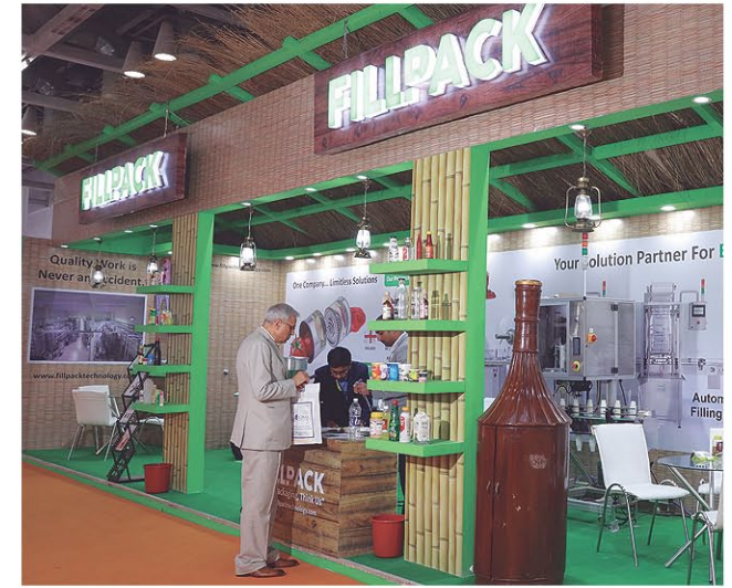
For more picture please visit our site : www.indusfood.co.in